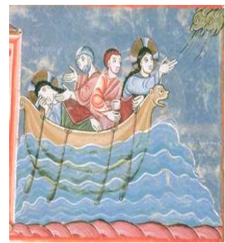
Today's Gospel: "Master, do you not care? We are going down!" Jesus said, "Be calm!" and the wind dropped, and all was calm again.

A Concert at Holy Cross. Spem in Alium, involving 40 singers spread around the church. Next Saturday 27 June, 7.30pm. You are warmly invited to join the Leicestershire Chorale for this concert. Please note that the Church will be used for rehearsals on Saturday afternoon, so the Blessed Sacrament will be removed to the private chapel in the Priory after the 12:30pm Mass. Tickets £10 (£12 on the door); £5 NUS; or £1 under 19's. Email tickets@leicestershirechorale.org.uk, phone 07992 123 630, or visit www.leicestershirechorale.ticketsource.co.uk.