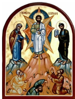
Today's Gospel: In the presence of Peter, James and John, He was transfigured: His clothes became dazzlingly white, whiter than any earthly bleacher could make them.

On-Street Car Parking. Charges have not been applied, and will not apply until the notices on the machines and roadside signs are altered. So, check the signs if parking in Wellington Street.