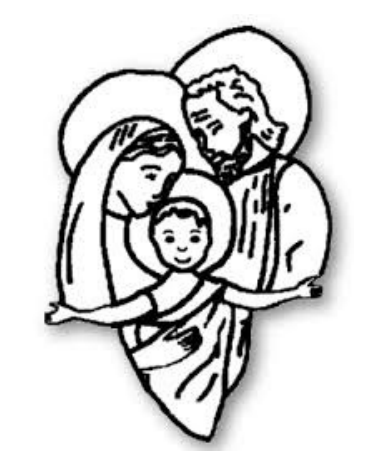
The Holy Family of Jesus, Mary and Joseph.

Sponsor the Sanctuary Lamp. If you are willing to sponsor the sanctuary lamp to burn for your intentions for one week, please pick up an envelope. The friars will pray for this intention each day. The minimum suggested donation is £10.