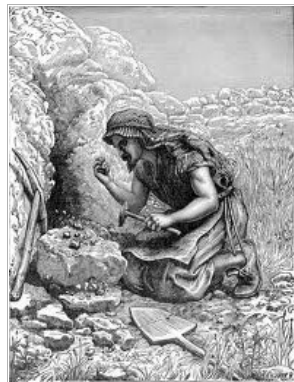
Today's Gospel: “The kingdom of heaven is like treasure hidden in a field ...”

Around the Bible in 80 weeks. We have now completed our study of the New Testament and will be taking a break until the Autumn before starting the Old Testament. The whole series so far may be seen on the parish website.