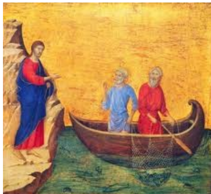
Today's Gospel: "Follow me and I will make you into fishers of men."

Vacancy: South Nottingham Catholic Academy Trust is seeking to appoint a faithful, enthusiastic and practising Catholic to the post of School Chaplain from 1 September 2012 on a full time, all year round basis. For an application pack please visit The Becket School website: www.becketonline.co.uk . The closing date is TOMORROW Monday 23 January (9am).