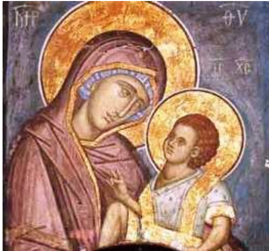
Hail, Holy Mother, who gave birth to the King, who rules heaven and earth for ever.

Please leave these items after any Mass. Thank you.